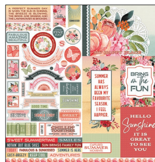
SUNSHINE SKIES PD4305