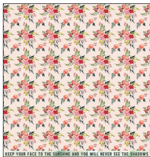
SUMMER LOVE PD4301