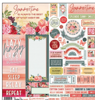
SUNSHINE SKIES PD4305